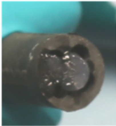
Lubricant on socket end of connector